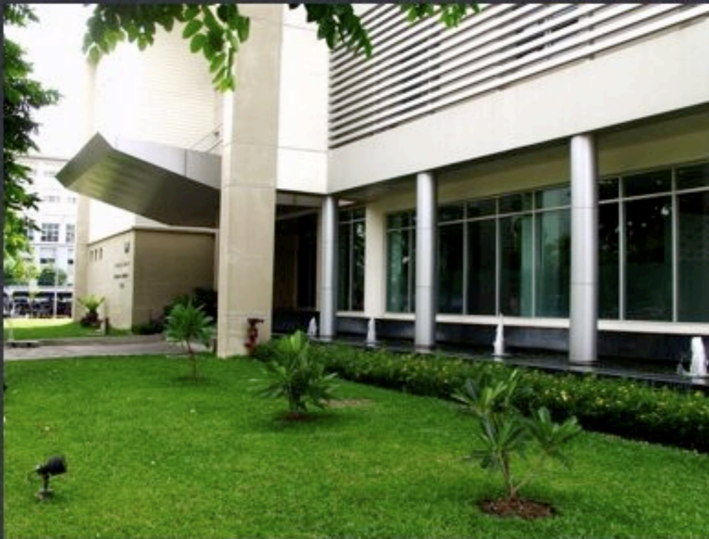
THAILAND SCIENCE PARK